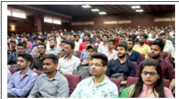
Company representatives & participants