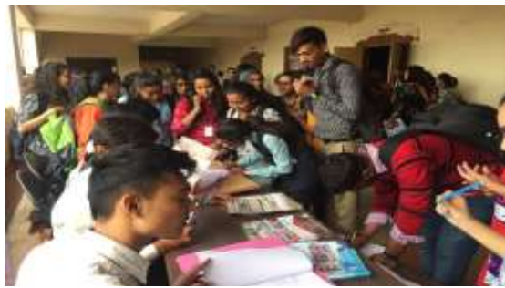
Registration Desk for participants